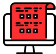
① Sending Your Entry Form