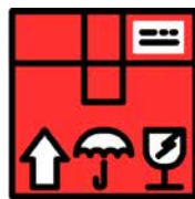
③ Sending Your Wines