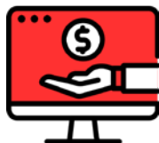
② Participation Fee